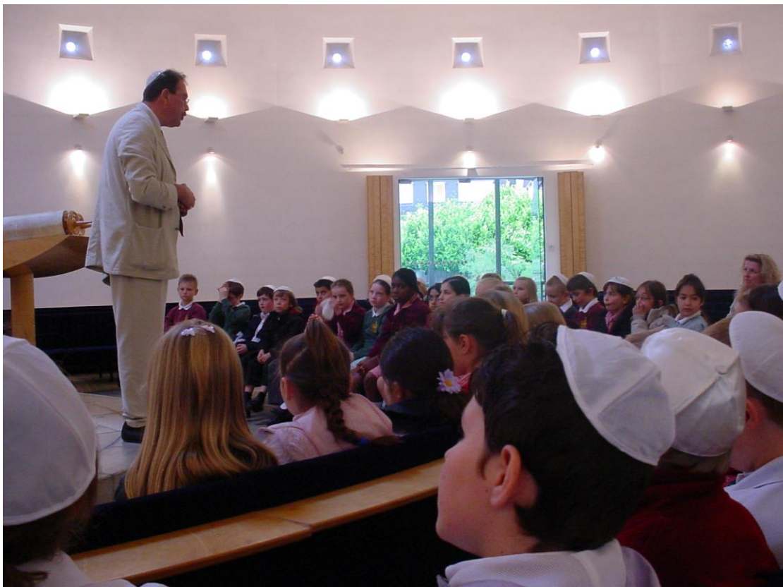
A visit to a Synagogue by a group of Havering pupils